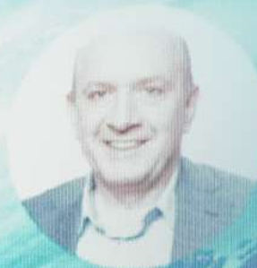
GRIGORE-KALEV STOICESCU Diplomat and member of the Parliament, National Defence Committee (Estonia)