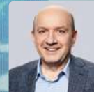
GRIGORE-KALEV STOICESCU Diplomat and member of the Parliament, National Defence Committee (Estonia)