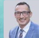
JAROSLAV BŽOCH Vice-chairman, Parliamentary Committee on Foreign and European Affairs (Czech Republic)