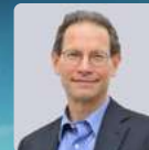
CHARLES A. KUPCHAN Senior Fellow, Council on Foreign Relations (USA)