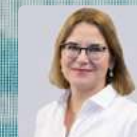
LIISA-LY PAKOSTA Chairwoman, Parliamentary Committee for the European Union Affairs (Estonia)