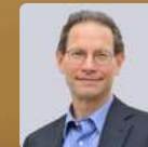
CHARLES A. KUPCHAN Senior Fellow, Council on Foreign Relations (USA)