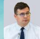
LAURYNAS KASČIŪNAS Head, OSCE Parliamentary Assembly Delegation (Lithuania)