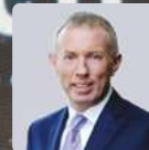
TIMMY DOOLEY Co-President of the ALDE party (Republic of Ireland)