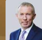
TIMMY DOOLEY Co-President of the ALDE party (Republic of Ireland)