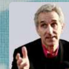
JEFFREY GEDMIN Acting President, Radio Free Europe/Radio Liberty (USA)