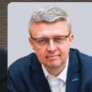
KAREL HAVLÍČEK Vice-Chairman of the Chamber of Deputies of the Parliament of the Czech Republic (Czech Republic)

“It is simple. There is a struggle between good and evil. Between terror and brutality on one side and freedom and democracy on the other.”