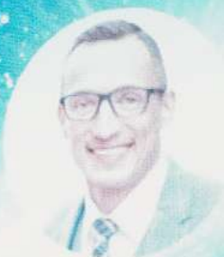
JAROSLAV BŽOCH Vice-chairman, Parliamentary Committee on Foreign and European Affairs (Czech Republic)