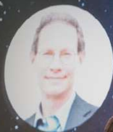
CHARLES A. KUPCHAN Senior Fellow, Council on Foreign Relations (USA)